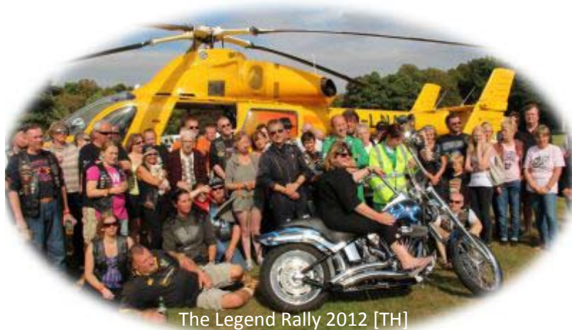
The Legend Rally 2012 [TH]