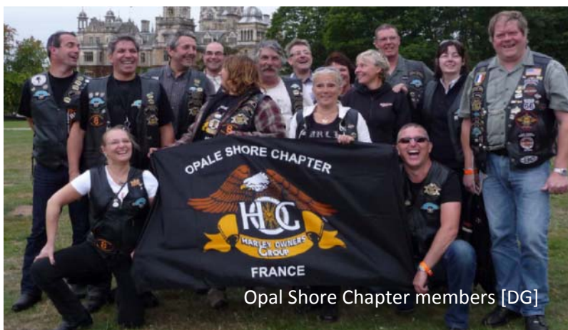
Opal Shore Chapter members [DG]

The rally opened its gates at midday on Thursday 2 nd September when more than 180 rally guests checked in for the festivities. More arrived the following day and more than 300 guests enjoyed the weekend's Sherwood hospitality, including a large contingent of Opale Shore Chapter (France) who visited the rally for their first time.